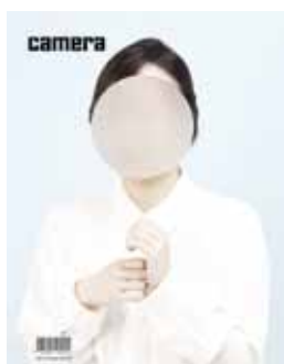
Camera #3 jul/aug/sept