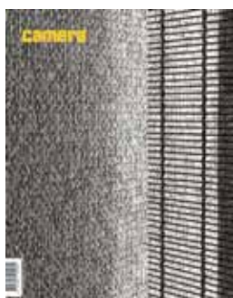
Camera #5 feb/march/april