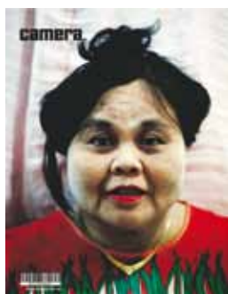
Camera #1 jan/feb/march