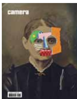
Camera #4 oct/nov/dec